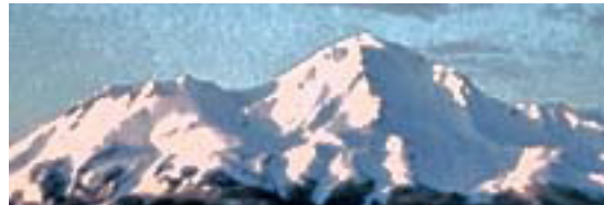
Sand Flat Campsite Bunny Flat Trailhead